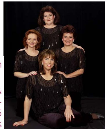
Amazing Accolade—National Champion Female Barbershop Quartet—now heading for