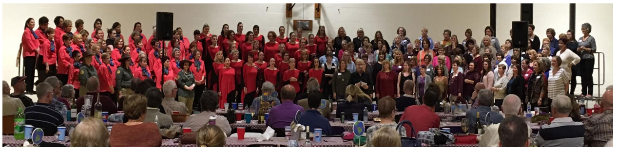
Circular Keys Chorus, Vocal Motion Chorus and River Blenders Chorus singing together on the risers in St Louis 2018