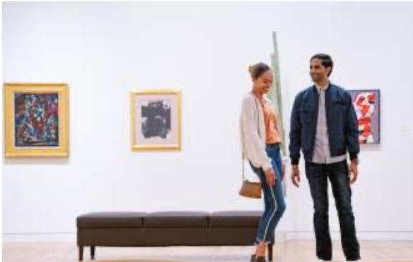
Columbus Museum of Art